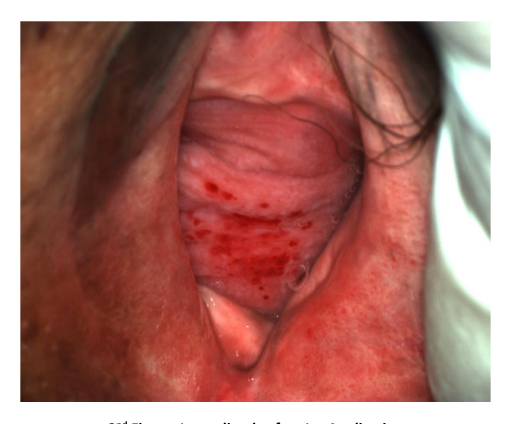
2<sup>nd</sup> Figure: Immediately after 1at Application