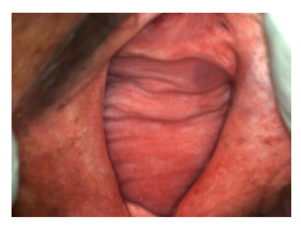
1<sup>st</sup> Figure : Before the Application