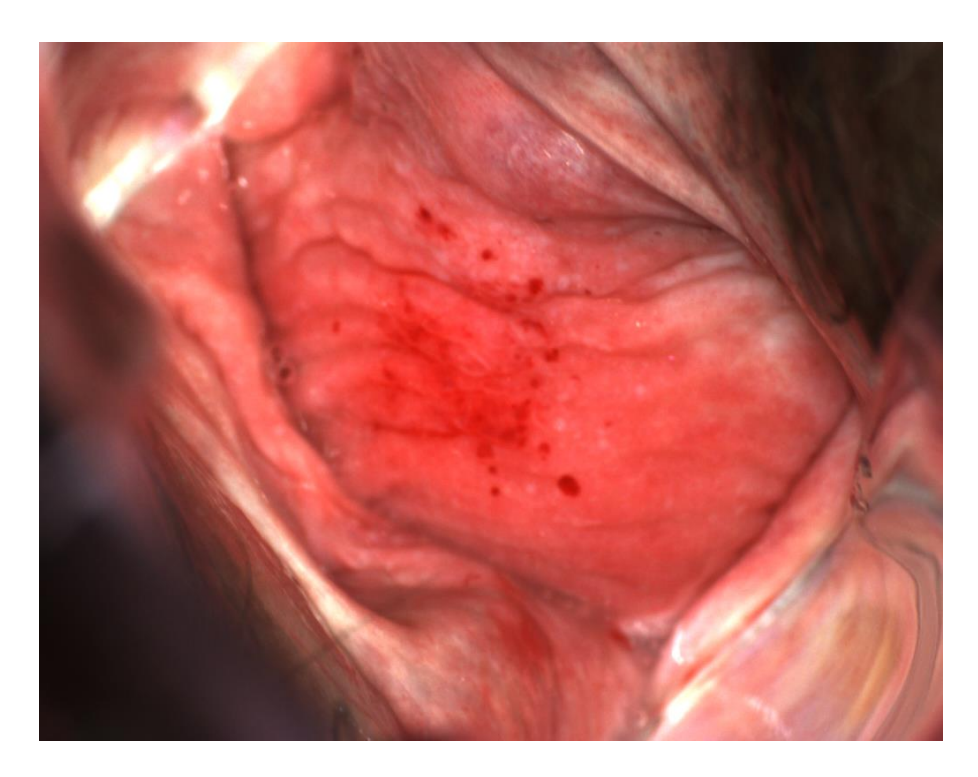
3d Figure: Immediately after 2<sup>nd</sup> Application