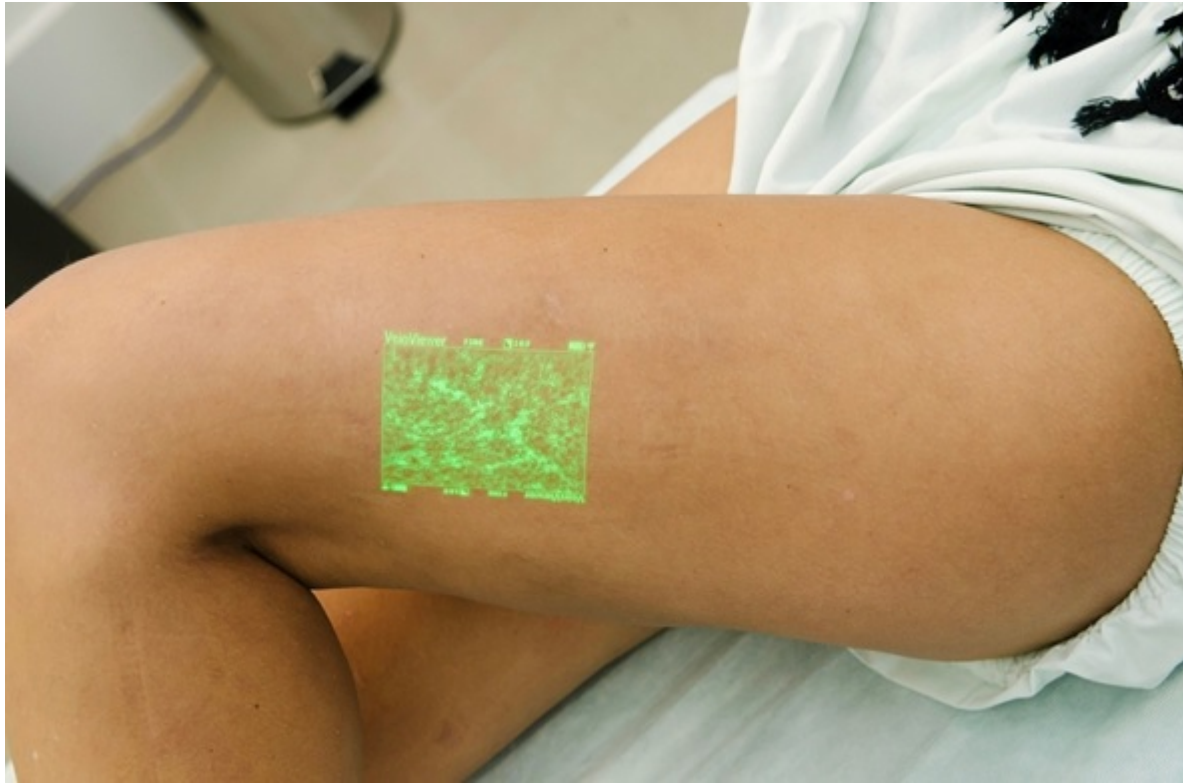
Figure 1(B): photograph after 3 CLaCS sessions