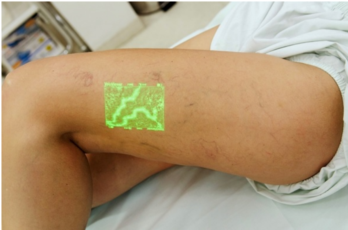
Figure 1A: Photograph before treatment.

It is strongly recommended at least 20 pre-treatment photos; with the CLaCS technique, 40 pre-treatment photographs on average are taken, with and without AR. Only the pre and post photo documentation can provide objective evidence of the outcome. Neither the patient nor the doctor can appreciate the improvement without the use of photography. Figure 1 depicts an example of pre and post photos.