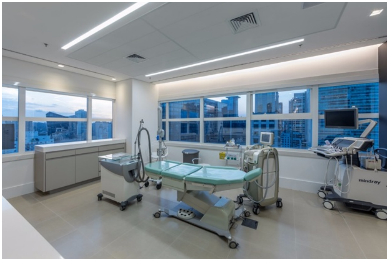
Figure 3: Phlebo-suite is a room prepared for diagnosis and aesthetic vein treatment. Ideally, it should include photo equipment, duplex ultrasound, augmented reality, skin cooler, transdermal laser, and magnification loupe. A complete phlebo-suite may also contain endovenous laser/radiofrequency devices.